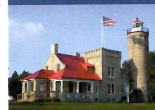
Mackinac Point Lighthouse