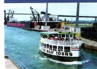
Soo Locks Cruise in Sault Sainte Marie