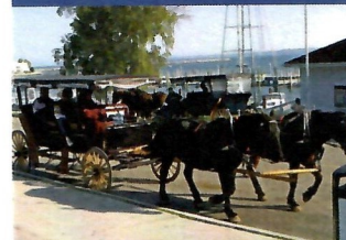
Tour Mackinac Island by Horse and Carriage