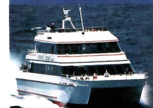
Mackinac Island Ferry

Departure: Osiris Shrine Center, 91 Kruger St, Wheeling, WV @ 8 am